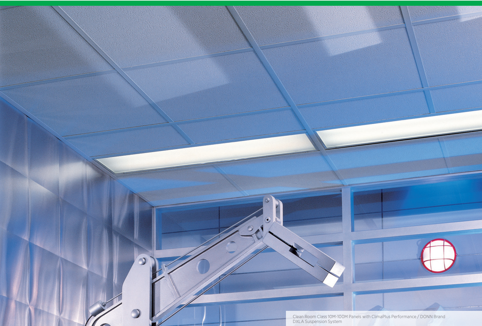
Clean Room Class 10M-100M Panels with ClimaPlus Performance / DONN Brand DXLA Suspension System